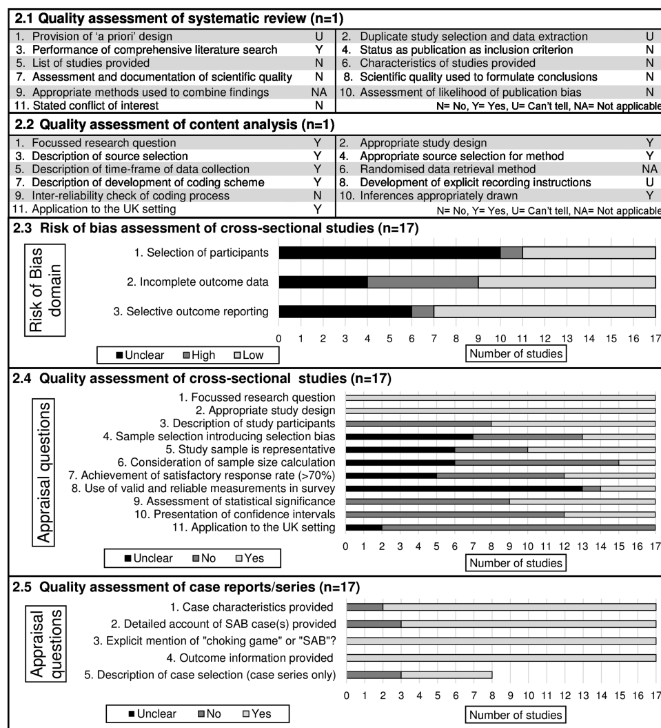
Figure 2 Findings from quality assessment of included studies. SAB, self-asphyxial behaviour.

A summary of quality assessment results is presented in figure 2. The systematic review was of uncertain quality as limited information was provided on its methodology; the content analysis